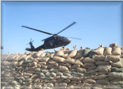
Return to Sharana : Mission Complete

As the days get longer and busier, we also prepare for the upcoming departure of TF Gambler and will soon welcome a new Task Force to FOB Sharana.