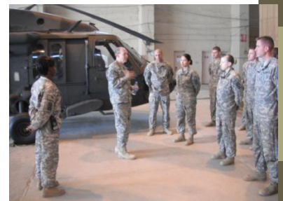
GEN Martin Dempsey Speaks to Dustoff Soldiers